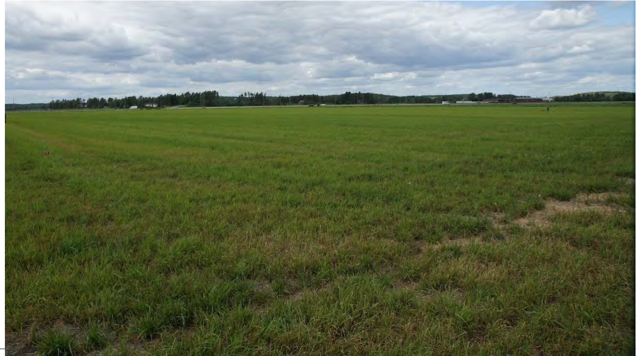
Suomen Hovawart ry – Finnish Hovawart Club, Finland