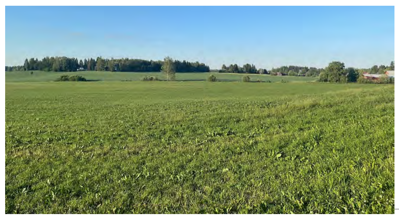
Suomen Hovawart ry – Finnish Hovawart Club, Finland