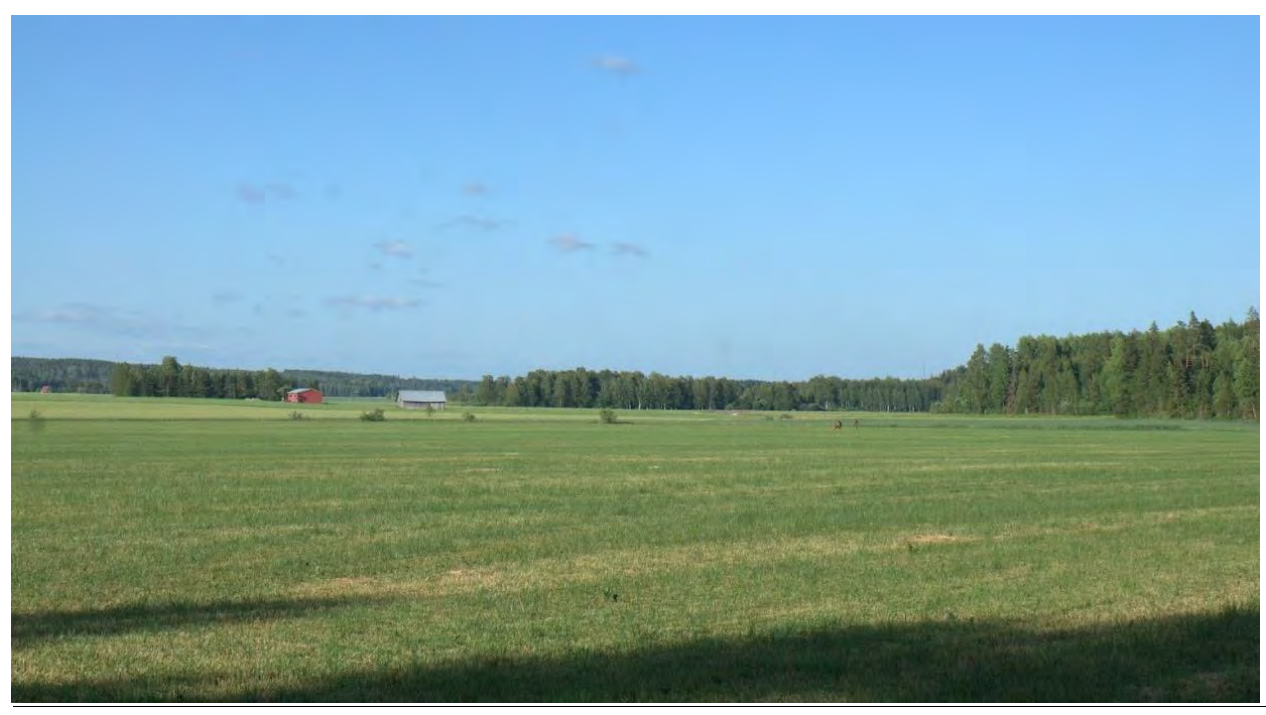
Suomen Hovawart ry – Finnish Hovawart Club, Finland